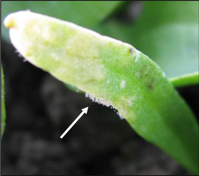
Figure 4. Sporulation of Peronospora effusa on a cotyledon of an inoculated spinach seedling, representing a susceptible reaction to that race of the pathogen.