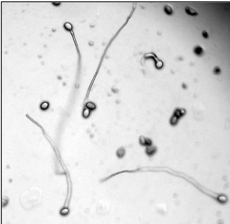
Figure 6. Germinating sporangia of Peronospora effusa on a plate of water agar 24 hours after spraying a sporangial suspension onto the agar, as a test of viability of the pathogen isolate.