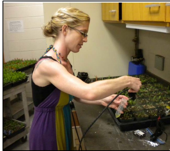
Figure 2. Inoculating seedlings of spinach differential cultivars with Peronospora effusa spores using an air-brush paint sprayer with compressed air.