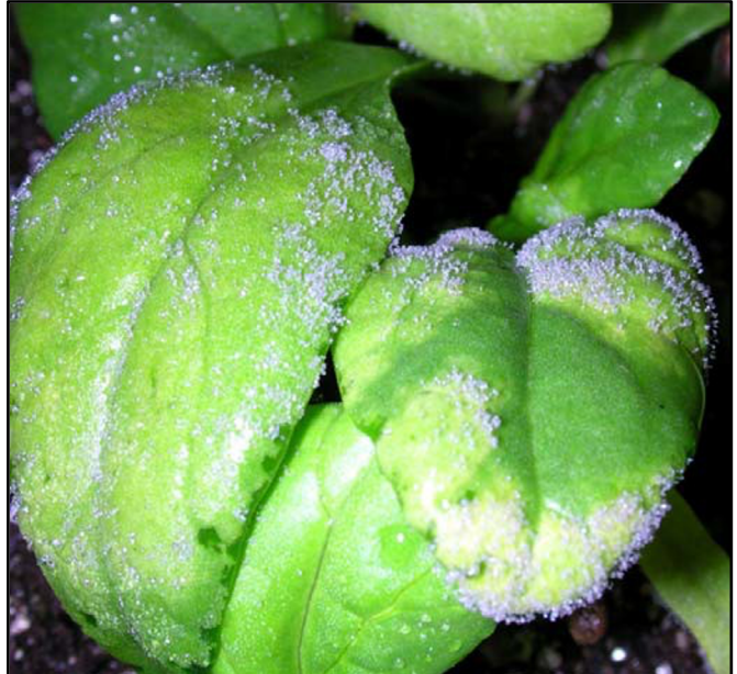
Figure 5. Sporulation of Peronospora effusa on a true leaf of an inoculated spinach seedling, representing a susceptible reaction to that race of the pathogen.