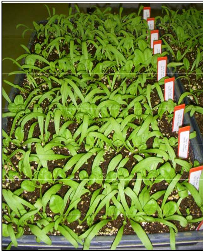
Figure 1. Seedlings of spinach differential cultivars ready for inoculation with an isolate of the downy mildew pathogen.