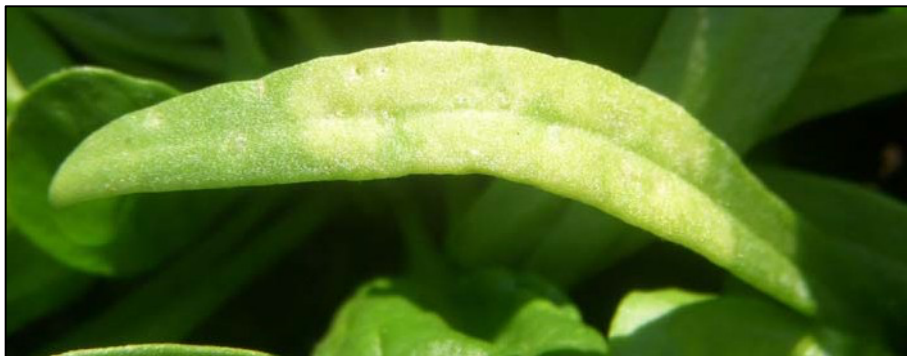
Figure 3. Chlorosis on a cotyledon of a spinach seedling inoculated with an isolate of Peronospora effusa .