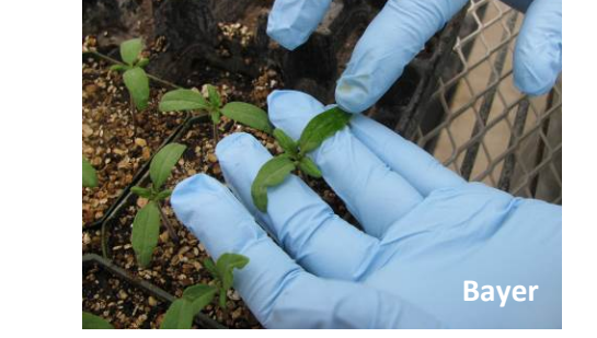
Fig. 7. Dip a gloved finger into inoculum mixture