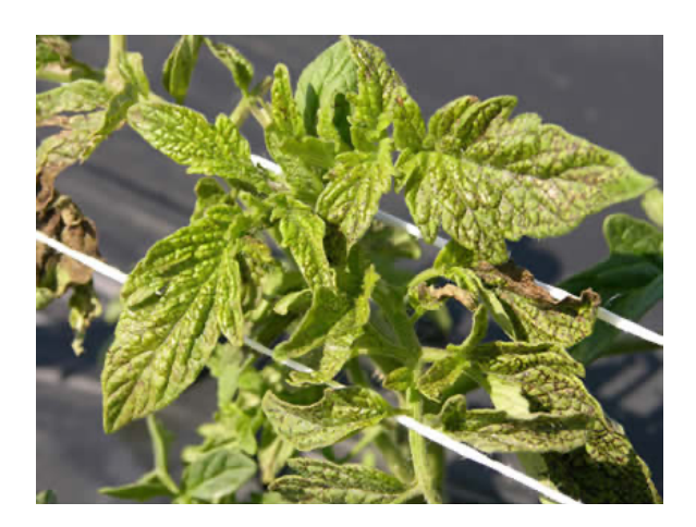
Fig. 1. Symptoms of early TSWV infection

Symptoms of the disease in tomato can vary with the host plant, time of year, as well as environmental conditions and include stunting, necrosis, bronzing, chlorosis, ringspots and ring patterns that affect leaves, stems and fruit (German et al 1992; Mumford et al 1996).