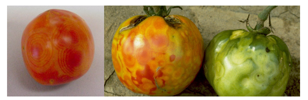
Fig. 3. TSWV fruit symptoms