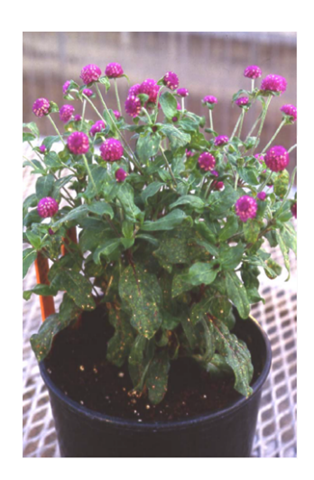
Fig. 4. TSWV culture in G. globosum

Preparation of host plants and inoculum: Susceptible tomato seedlings for a fresh culture, inoculum production or for strain testing are grown until the first-true leaves are emerging (Fig. 5). Ten seedlings per replication and two to three replications per variety are recommended for resistance and susceptibility testing. Inoculum is collected from the cultured host and prepared by flash freezing fresh symptomatic plant tissue with liquid nitrogen (Fig. 6), then homogenized in chilled 0.01M phosphate buffer, pH 7.0 to which 0.1% Na<sub>2</sub>SO<sub>3</sub> is added (1:10 tissue to buffer weight by volume). If liquid nitrogen is not available, symptomatic tissue can be macerated in chilled phosphate buffer then diluted as described above. The buffered inoculum should remain chilled throughout the inoculation process. Abrasive agents (eg., carborundum or celite) may be used to enhance inoculation efficacy. Cotyledons or first true leaves are gently rub inoculated Fig. 7 – 8). After 2 – 3 weeks, the inoculum is ready for use. Depending on the time of year, seedlings for strain testing should be planted so test seedlings and inoculum are ready at about the same time. One to two inoculations may be needed to ensure 100% of the susceptible seedlings develop symptoms.