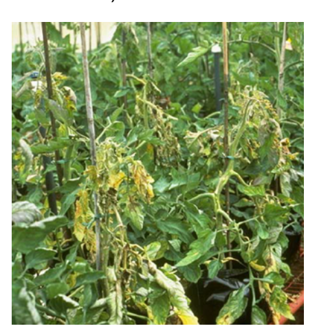
Fig. 2. Symptoms of late TSWV infection