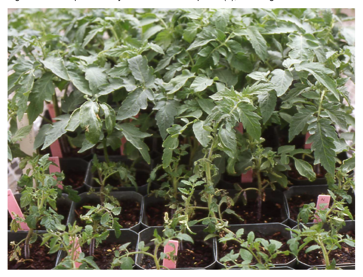
Fig. 10. Symptomless resistant (rear) and stunted susceptible (front) responses in tested seedlings.