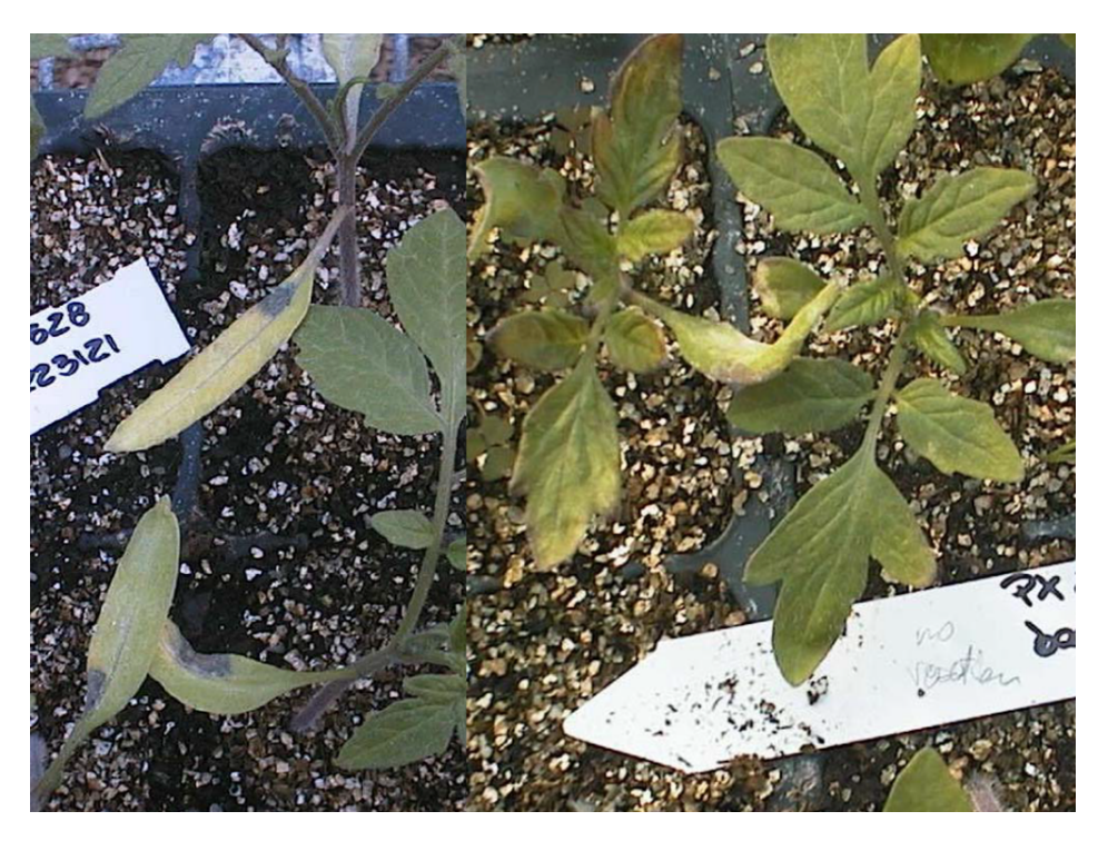
Fig. 9. Necrotic spots on cotyledons of resistant plants (L); Bronzing and chlorosis in susceptible plants