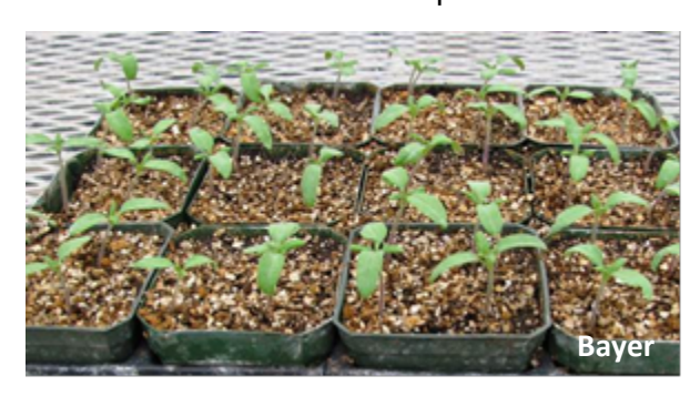
Fig. 5. Tomato seedlings, first true leaf emerging

Our experience in screening tomato lines for resistance to TSWV, has demonstrated that symptom development is best facilitated by minimizing the number of sequential mechanical inoculations between thrips inoculated material and the tested plant lines. Three sequential mechanical inoculations are used in this protocol.